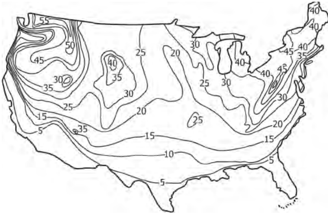
Figure 523–1 Isoline Map of the Freeze-Thaw Severity Index for Contiguous 48 United States (map is from ASTM D5312)