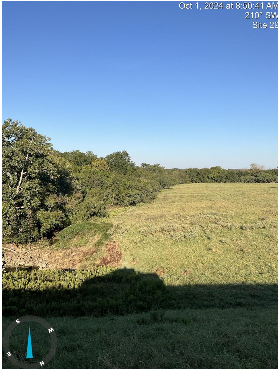
The photo above represents the existing site conditions looking towards the end of the auxiliary spillway.