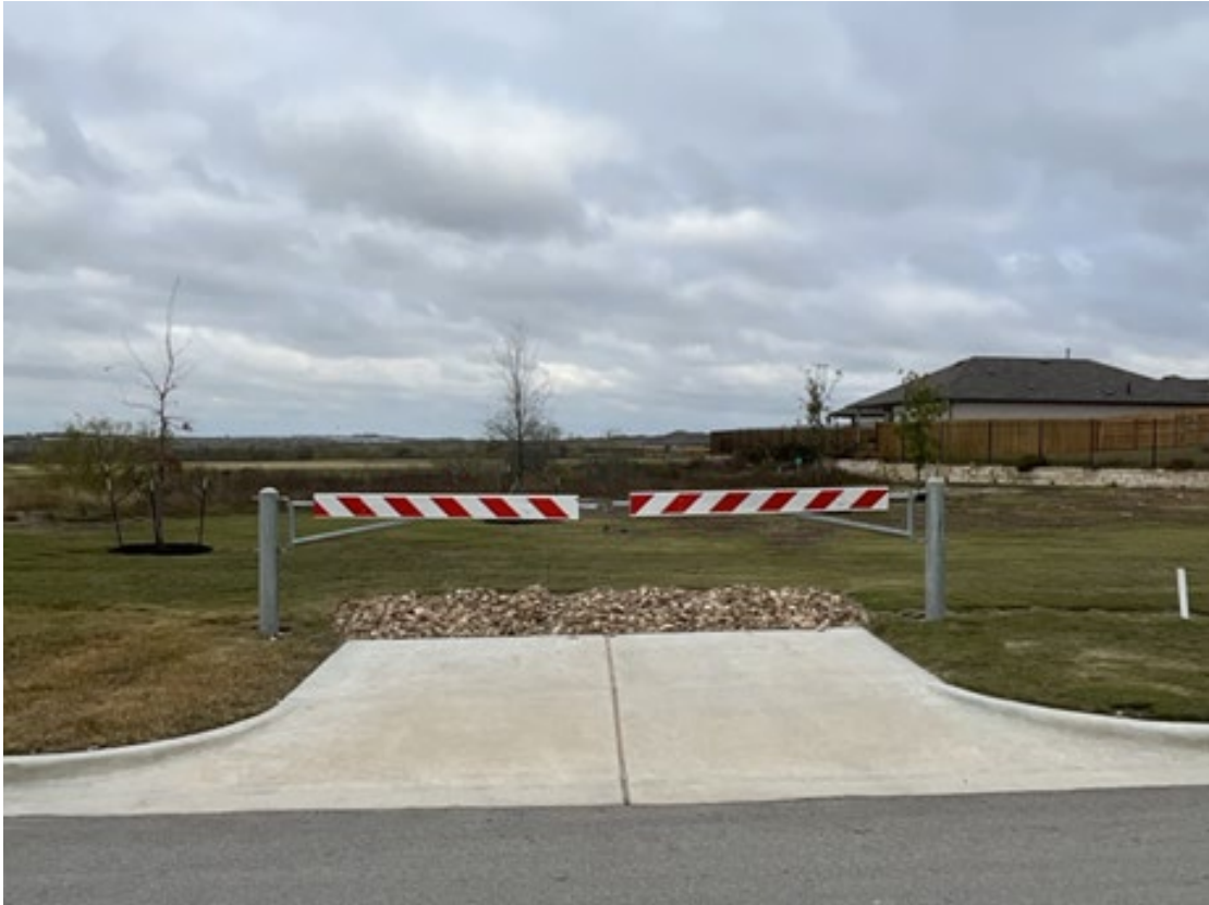
The above photo shows the easement access gates, bull rock, concrete driveway and lock.