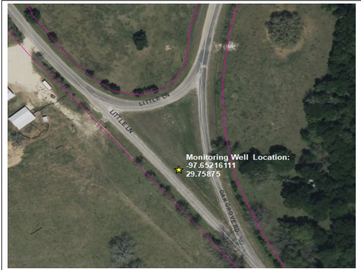
Figure 2: The aerial image above shows the location of the monitoring well to be drilled, which is within the right-of-Way of Little Lane.